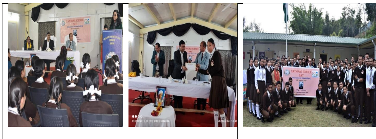
Fig: Glimpses of celebration of National Science Day